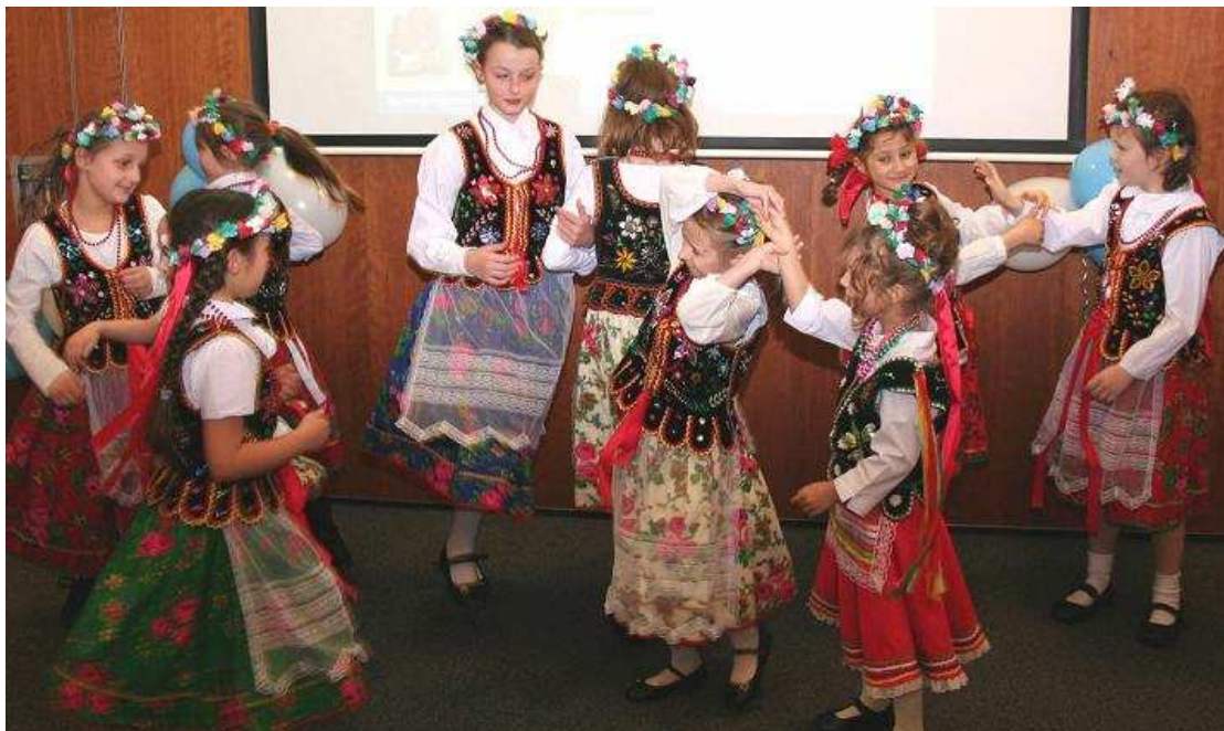
Polish school children perform at the Working Together Awards.